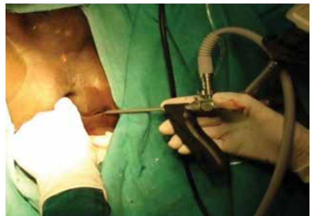
Figure 2. Fistuloscope Introduction Through External Fistula Opening During Video-Assisted Anal Fistula Treatment (27)

In the last decade lots of articles have been published about AFP. According to articles, there are variable success and failure rates of AFP reported (29). According to some studies from USA (30-32), China (33) and Italy (34, 35) the success rate of AFP was between 25-85%. Some studies point out that the success rate depends on factors like multiple prior attempts for closure (36), previous surgery (37, 38), incontinence (39), complicity of fistula (40), cost