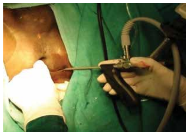
Figure 2. Fistuloscope Introduction Through External Fistula Opening During Video-Assisted Anal Fistula Treatment (27)

In the last decade lots of articles have been published about AFP. According to articles, there are variable success and failure rates of AFP reported (29). According to some studies from USA (30-32), China (33) and Italy (34, 35) the success rate of AFP was between 25-85%. Some studies point out that the success rate depends on factors like multiple prior attempts for closure (36), previous surgery (37, 38), incontinence (39), complicity of fistula (40), cost