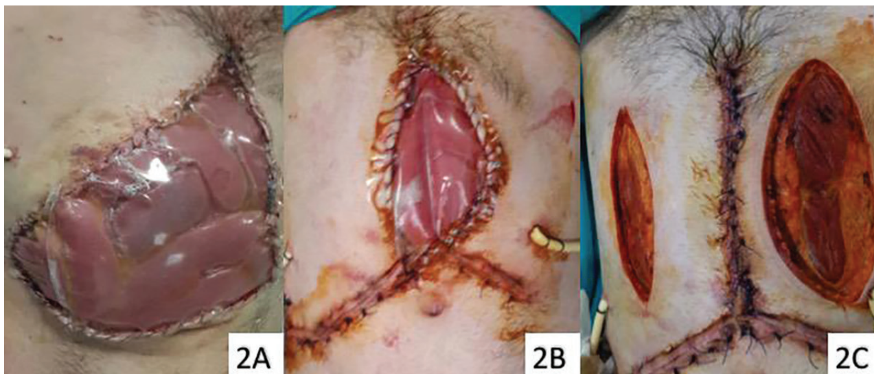
Fig. 2. Closure of the open abdomen with multiple sessions (A-B-C)