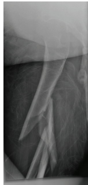
Fig. 2. Anteroposterior (AP) and Lateral radiograph post-failed fixation revealing a comminuted femoral fracture.

The surgical technique employed was that of a standard femoral nail technique. The patient is placed supine on a traction table. Fluoroscopy is employed to gain as best reduction by manipulating the limb as can be achieved. Following skin preparation and draping, a small incision is made proximal to the greater trochanter. Through this, the greater trochanter entry point is placed with use of a guide wire, over which the entry reamer for the proximal portion of the nail is used.