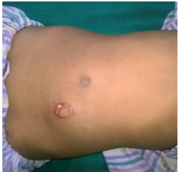
Fig. 1. Handle bar mark in left iliac fossa

Selby was the first to describe traumatic abdominal wall hernia in 1906 more than a century ago and Dimyan et al in 1980 described the association of traumatic abdominal wall hernia with handlebar injury and used the term hernia of the handlebar [1, 2]. A traumatic abdominal wall hernia is defined as a herniation of viscera through the disruption of muscles and fascia after a trauma without necessarily breaching the overlying skin and no signs of previous hernia at the same site [3]. Until 2013 around 250