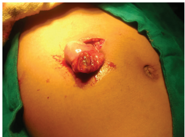
Fig.3. Small bowel protruding from abdominal wall with pouting perforation.

cases of traumatic abdominal wall were reported in the medical literature worldwide in the form of case reports and case series and around 15% of these were due to handlebar injury [4]. Recent review of published data on handlebar hernia in the medical literature reveals around 80 cases of handlebar hernia till date (Table 1). In India out of these less than ten