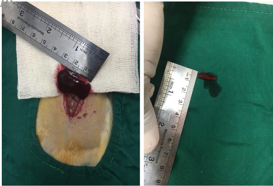
Fig. 1. A laceration model in the middle lobe of the liver.

cages under the care of a veterinarian and standard care including food and water.