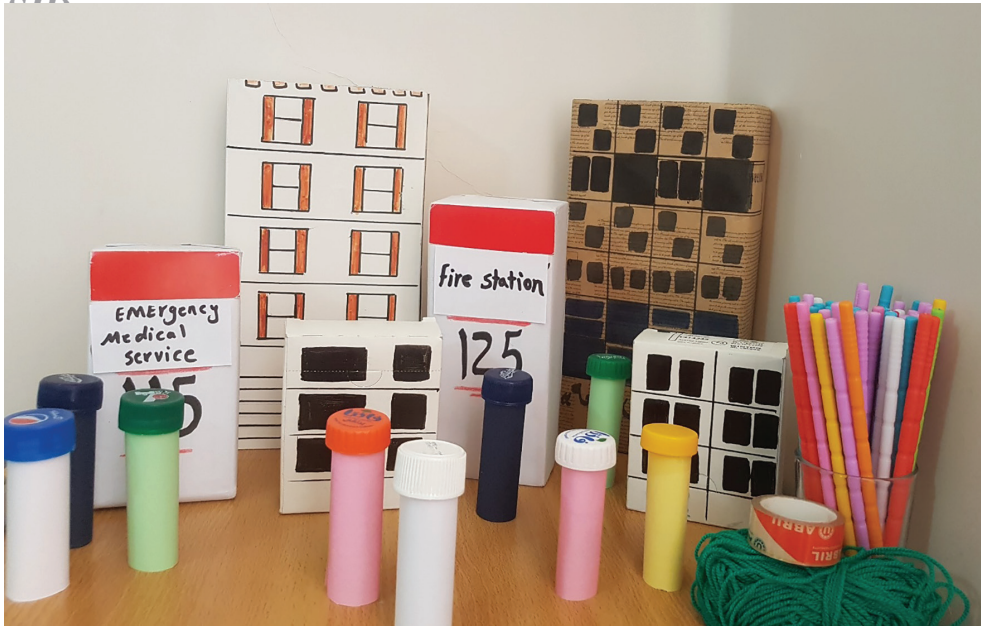
Fig. 1. Tools used for demonstration of the game method.