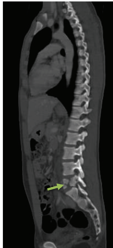
Fig. 1. Sagittal Computed Tomography (CT) scan of the whole spine showing burst fracture at L5 (arrow) with canal compromise (Magerl A3).

On day four post-admission, an emergency consultation call was sent to our intensive care unit (ICU) in view of patient's deteriorating status. When seen, he was grossly pale and febrile at 101 F, pulse rate of 140 per minute, systolic blood pressure of 80 mmHg and respiratory rate of 32 per minute maintaining oxygen saturation around 90% on oxygen face-mask. Patient's GCS was 15. Chest auscultation revealed bilateral diffuse coarse crepitation and he was immediately transferred to the ICU. Initial arterial blood gas (ABG) showed partial pressure oxygen (pO 2 ) of 49mm Hg on oxygen by face mask. Patient was intubated, sedated, paralyzed