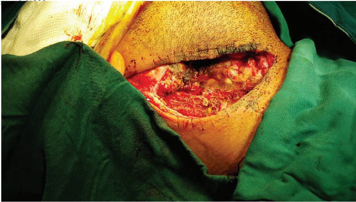
Fig. 3 The intraoperative image demonstrating the aneurysm in distal segment of the internal carotid artery after reoperation.

internal carotid artery without any aneurysm residue. The patient received anticoagulation for 3 months and was followed in outpatient clinic. After 1 year of follow-up he was completely asymptomatic and the angiogram revealed patent parent vessel without residue. The patient and his family provided their informed written consent for publication of the case and the images.