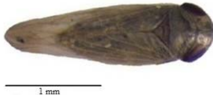
Figure 1 Aconurella nuristana Dlabola, 1957, dorsal view of male.