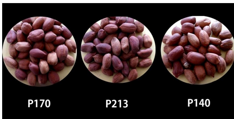
Figure 4 The morphology of kernels in peanut resistant genotypes Pn 170, Pn213 and Pn140.

Means in the same column followed by a different letter are significantly different at 0.05 probability level.