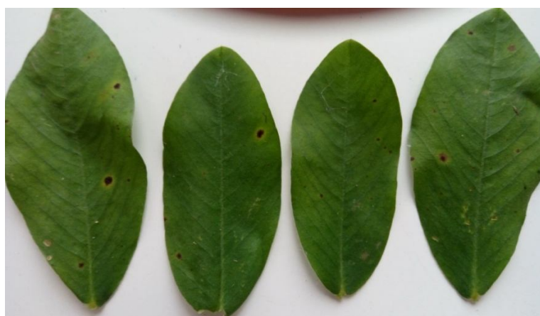
Figure 3 Leaf spot severity in resistant peanut genotype Pn140.