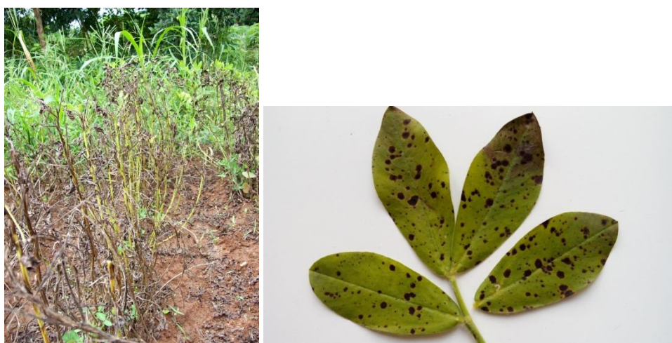
Figure 2 Leaf spot severity and defoliation in susceptible peanut genotype Pn202.