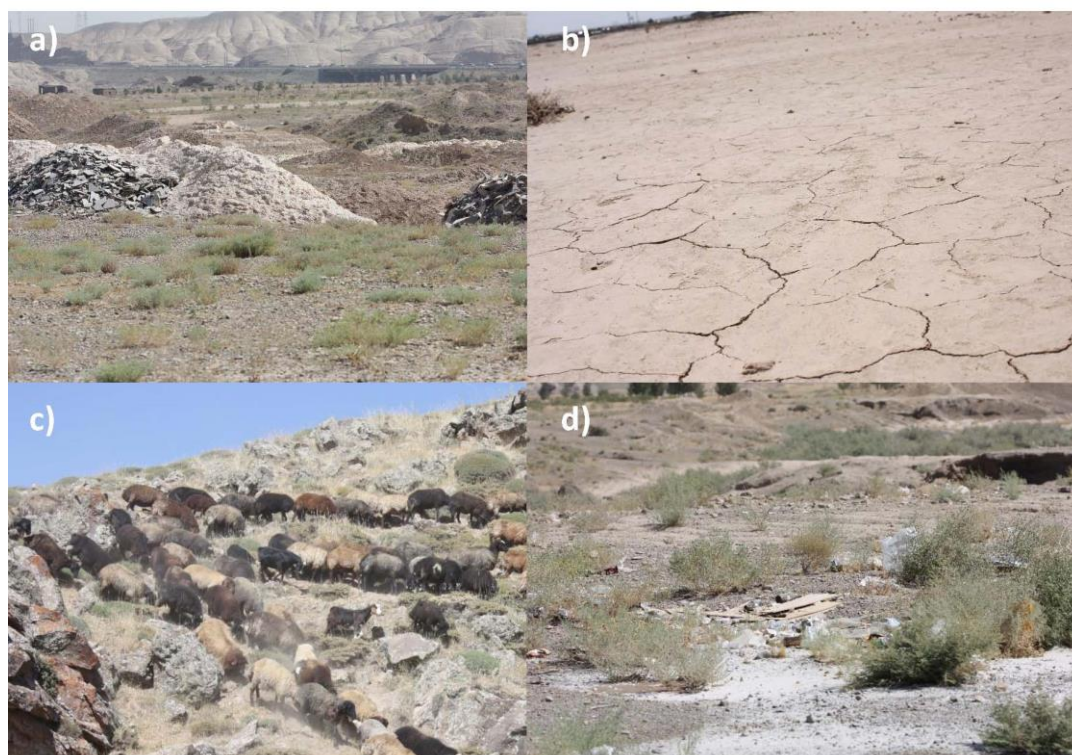
Figure 2 Main reasons for Orthoptera decline in Iran: a) habitat destruction for construction, b) desertification, c) overgrazing, and d) pollution.