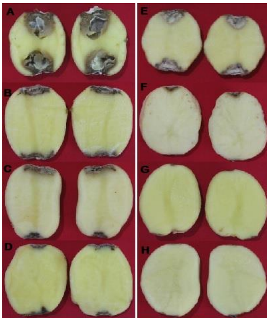
Figure 2 The effect of thiabendazole on Fusarium dry rot inhibition under in vivo condition. A: Control ( F. solani FPO-67); E: Control ( F. oxysporum FPO-39); B and F: Thiabendazole (1/1000); C and G: Thiabendazole (1.5/1000); D and H: Thiabendazole (2/1000).