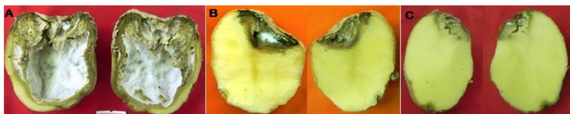
Figure 3 The effect of thiabendazole on prevention of dry rot in storage condition. A: Control ( Fusarium solani FPO-67); B: Imazalil (2/1000); C: Thiabendazole (2/1000).