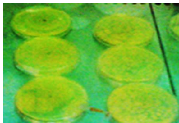
Figure 2 Production of yellow pigments by Aspergillus flavus isolates A42 (right) and CHAO50 (left) on APA medium after 10 days under UV light.

The level of aflatoxins produced by both isolates in vacuum condition was lower than control, while that was more than aflatoxins production of A. flavus isolates in 100% CO 2 condition (Table 1).