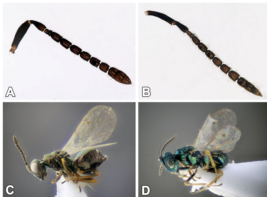
Figure 2 Harrizia mira (Delucchi, 1962). A. Antennae, female; B. Antennae, male; C. Adult female; D. Adult male.