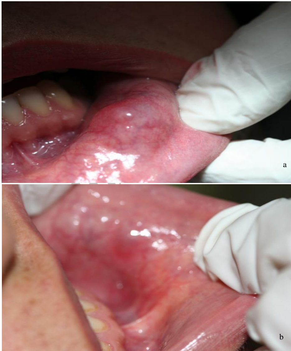
Figure 1. The full size mucocele before (a) and after (b) treatment with intralesional dexamethasone

Medical Ethics Committee of Shahid Beheshti University of Medical Sciences approved the study ethically in accordance with Helsinki Declaration. An informed written consent was obtained from all patients before injection.