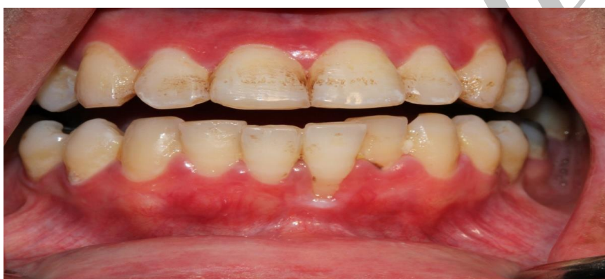
Figure 3. The gingiva was thin and fragile with limited localized plaque and calculus. Pocket depth was generally less than 2 mm