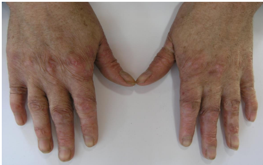
Figure 2. Dorsal side of hands showing atrophic scarring and cigarette paper-like wrinkling