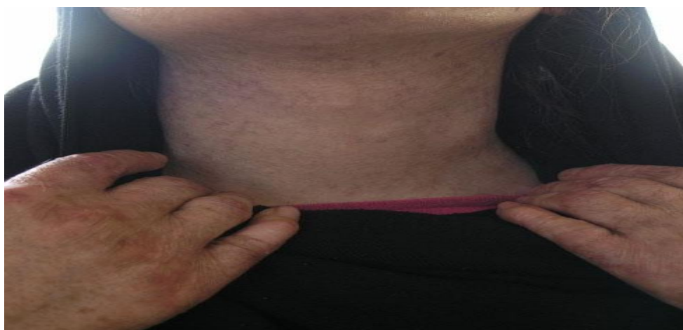
Figure 1. Multiple hypo- and hyperpigmentation patches over the neck

Histopathological examination of a biopsy taken from a plaque on her skin revealed hyperkeratosis with flattened rete ridges, epidermal atrophy, fibrosis in papillary and reticular dermis, and capillary formation in the form of network (Fig. 4). The dermis showed a mild lymphohistiocytic infiltration and pigmentary incontinence and hydropic degeneration of basal layer. Diagnosis of KS was made on the basis of clinical and histopathological examination.