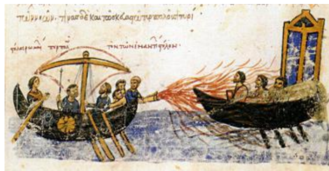
Figure 2. Using Greek fire against the fleet of the rebels (adopted from Codex Skylitzes Matritensis , Biblioteca Nacional de Madrid, Vitr. 26-2, Bild-Nr. 77, f 34 v. b. licenced (taken from Pászthy, p. 31))