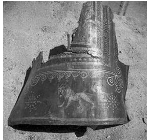
F. Persian artefact. Lion, the symbol of the Sassanid Empire.