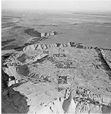
A. Dura-Europos, aerial view (1932)