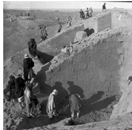
D. Dura-Europos. View of the excavation in the sixth season (1932–1933)