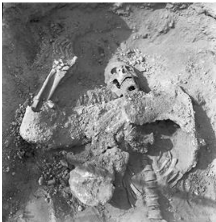
E. Dura-Europos. View of the excavation in the sixth season (1932–1933)