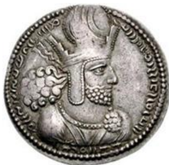
Figure 4. Shapur I, the second king (shah) of the Sasanian Empire (215 - 270 C.E.) [coin] wearing his famous crown.

According to the French discoverer, the carbonized top of