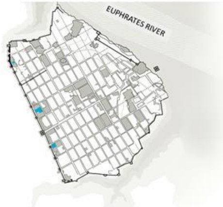
B. Schematic views (1932)