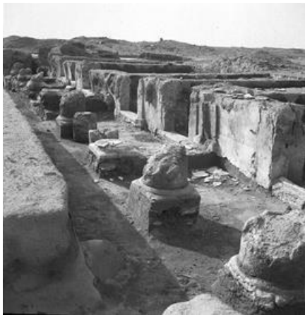
C. Roman infrastructure. Dura-Europos. View of the excavation in the sixth season (1932–1933)