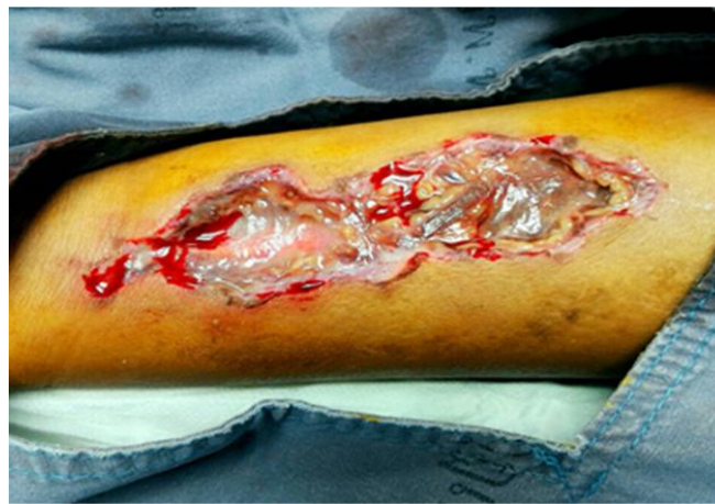
Figure 2. After debridement

metabolism when metabolized, producing Carbon monoxide (CO) via cytochrome P-450 2E1 and glutathione-S-transferase (1) (Figure 3). From an animal model, hepatic conversion of dichloromethane into CO was a saturable metabolic rate. (2)