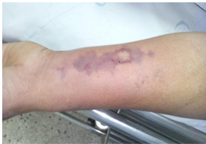
Figure 1. Local wound before debridement