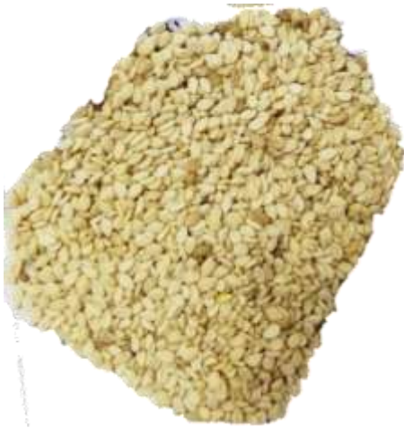
Figure 1. Kodo Millet crop consumed by the patient

Sinus bradycardia; Blood pressure was 90/60mmHg measured from the right upper limb in supine position; Glasgow Coma Scale – E4V5M5 (14/15); pupils normal and were reacting to light; no lateralizing signs; power and tone normal in all limbs. The primary adjunct point of care ultrasound showed ‘A’ profile with lung sliding in the Lung ultrasound, Inferior vena cava distensibility index 50% collapsible, 2D ECHO suggestive of normal left ventricular function, and serum calcium levels were 9 mg/dl.