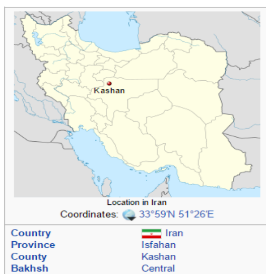
Fig.1: The location of Kashan city, Iran

This descriptive- analytical study was conducted on students in Kashan city ( Figure.1 ), Isfahan province, Iran. The study population including 10-12 th grade students.