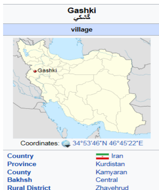
Fig.1: The location of Gashki, Kamyaran County, Kurdistan Province, Iran.