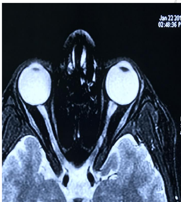
Fig.2: MRI Orbit T2 Hyperintensities in proximal bilateral optic nerve with post gadolinium contrast nodular enhancement in bilateral retrobulbar distal optic nerve.