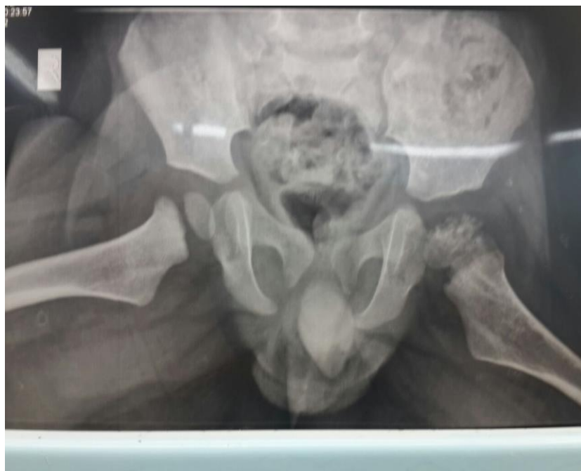
Fig.3: Follow-up X-ray pelvis anteroposterior.