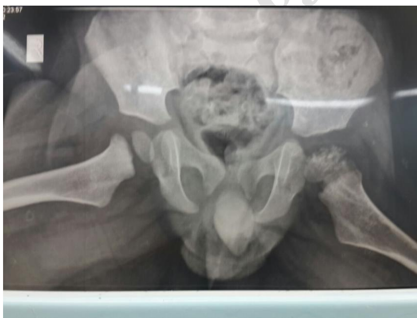
Fig.4: Follow-up X-ray frog-leg (containment is acceptable).