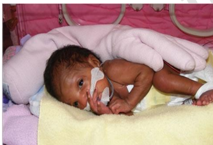
Fig.4: The Facilitated tucking position.