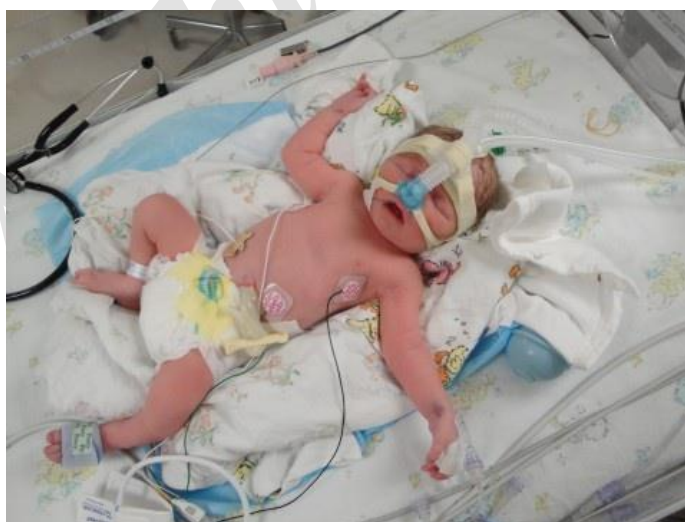
Fig.2: The Supine position.

Then, the neonate was placed in the second and third body positions as described earlier 30 minutes for each body position and relevant washout periods of 15 minutes. The pain measurements were done as described earlier. At the end, the videos were reviewed by a trained nurse to measure pain using the ALPS-Neo scale.