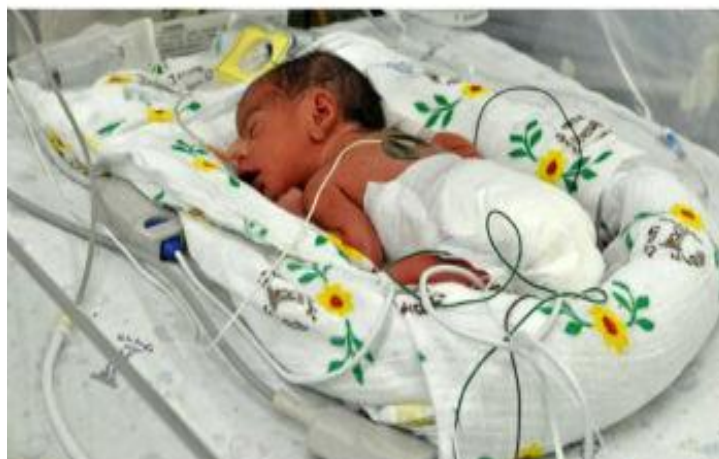
Fig.3: The Prone position.