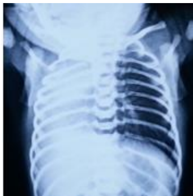
Fig.1: Frontal chest radiograph shows opacification of right hemithorax. Mediastinum appears to be deviated towards the right.

To rule out a perfect diagnosis Computerized Tomography was advised which showed agenesi