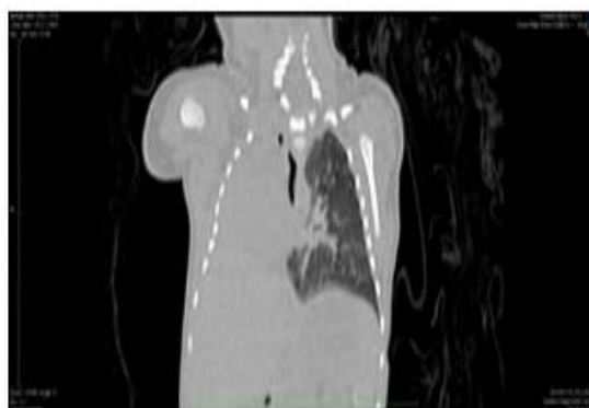
Fig.3: CT Axial Coronal Image in lung window. Mediastinum is displaced towards the right side.