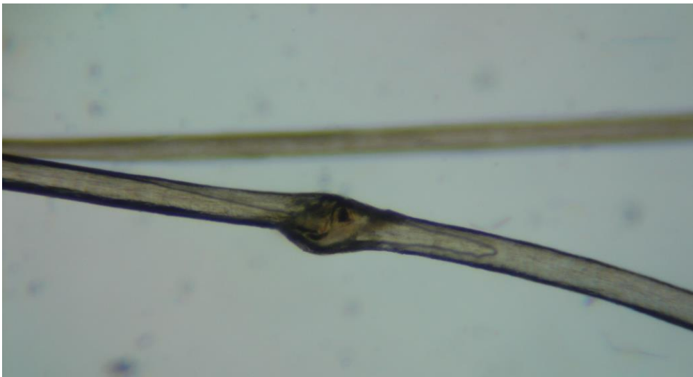
Fig.1: The bamboo shape Hair shaft anomaly in Netherton syndrome with light microscopy examination (case.1).

normal range. Examination his hair under light microscopy revealed trichorrhexis invaginata, highly suggestive for Netherton syndrome ( Figure.2 ). Starting corticosteroid with doses 2mg/kg/day resulted to improvement of disease. After two weeks prednisolone, tapered to 0.2mg/kg every other day and continued for three months, and then discontinued. The response to the treatment was excellent.