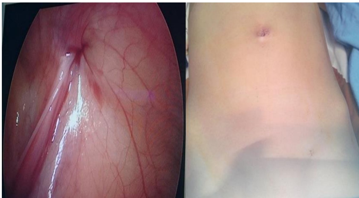
Fig.5: The knot tied. The internal inguinal ring closed, and the final postoperative appearance.