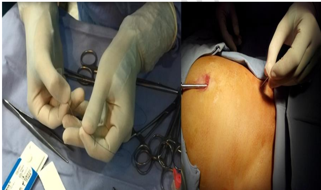
Fig.2: We used a pink bronule CH24. Introduction Prolene (3-0) thread through tip bronule. Then the skin punctured above the right inguinal ring. Different steps of the LAPEC procedure.