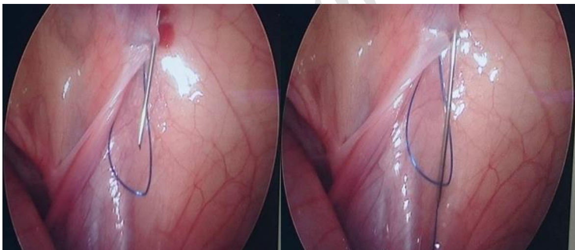
Fig.4: The needle inserted through the previous puncture point of the skin. B: The thread end pushed into the loop.