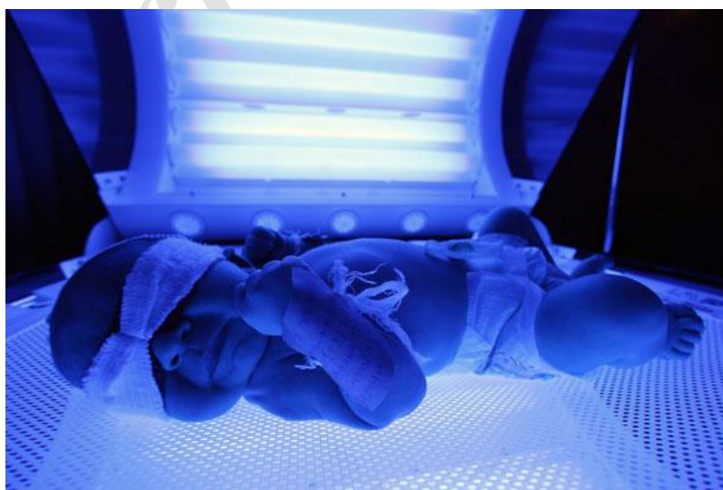
Fig1: Phototherapy in neonates.

Complications related to exchange transfusion included: hypocalcemia (serum calcium concentration less than 8 mg/dl in term infants and less than 7 mg /dl in preterm infants), hyperkalemia (serum potassium concentration greater than 5.5 mmol/L), hypoglycemia (plasma glucose concentration less than 40 mg/dl), thrombocytopenia (less than 150,000 platelet counts), sepsis (clinical signs of infection + positive blood culture), necrotizing enterocolitis (including abdominal distention and radiographic symptoms), cardiac arrhythmias and eventually death.