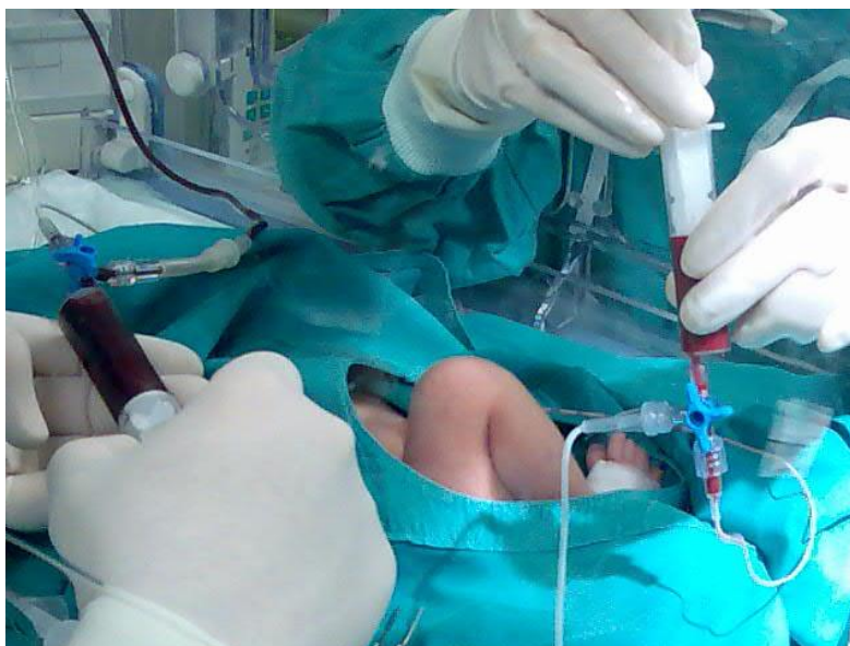
Fig.2: Exchange transfusion in neonates.