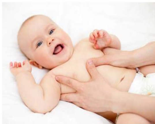
Fig1: The baby massage and touch using Field technique.