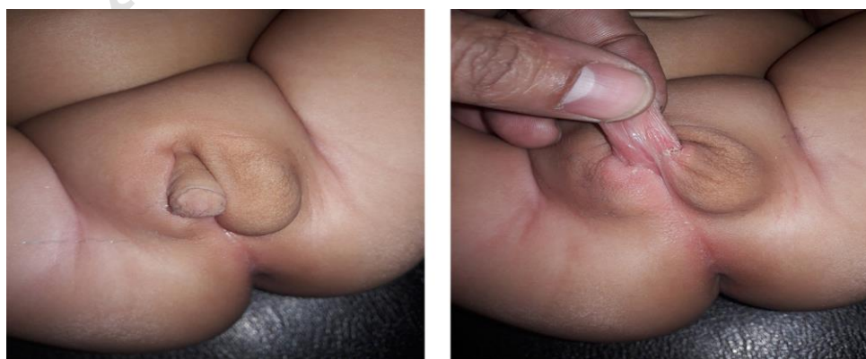
Fig.1: Clinical photo showing penoscrotal hypospadias, severe chordee, scrotal transposition and (L) Inguinal hernia.

hypospadias, chordee, and Penoscrotal transposition (PST). He was born in non-consanguineous family, to a primigravida mother of 33 years old, from an uncomplicated spontaneous vaginal delivery at term. She had no history of drug exposure, smoking, and alcohol intake during pregnancy. Also, there was no history of diabetes mellitus or hypertension. The child was 2,700 gr at birth and had an unremarkable postnatal course. On physical examination, he had penoscrotal hypospadias, severe ventral chordee and PST. He had a left side reducible inguinal hernia and the testes were normal in size, consistency and localized in the scrotum ( Figure.1 ). Karyotype was sought and revealed 47 XXY ( Figure.2 ). Serum luteinizing hormone, follicle- stimulating hormone, and testosterone levels was 7.1 and 2.3IU/l and 9ng/dl, respectively. Abdominal and pelvic ultrasound was normal and no Mullerian structures were identified. At 30 months, the boy underwent staged reconstructive surgery. In the first stage inguinal hernia was done, penile chordee and scrotal transposition were corrected. Subsequently urethroplasty was done after six months. The postoperative course was uneventful. The patient had good urinary stream and the cosmetic appearance of the genitalia during the immediate follow-up was satisfactory.