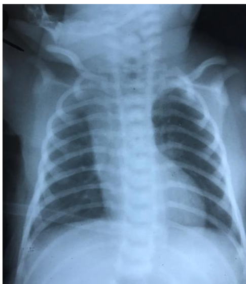
Fig.2: Chest X-ray showing thoracostomy tube and resolution of pleural effusion.