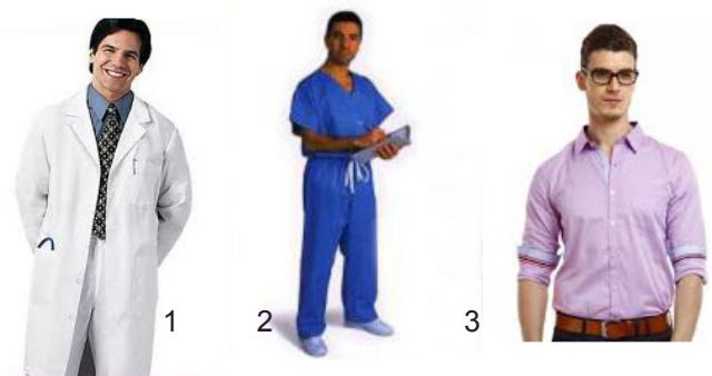
Figure 1. Different surgical attire shown to survey participants