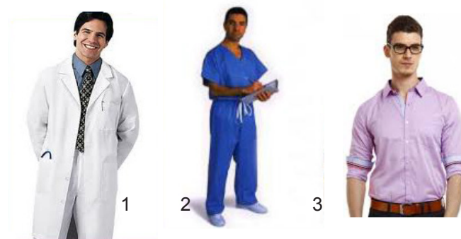
Figure 1. Different surgical attire shown to survey participants