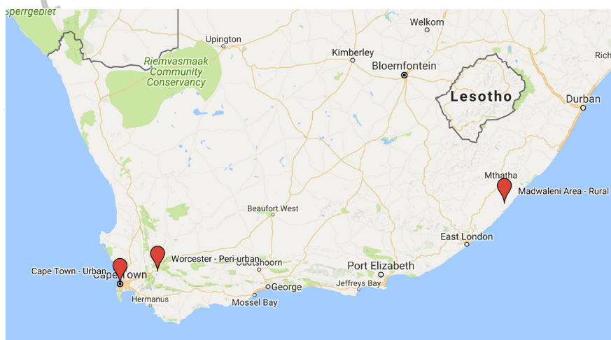
Figure 1. Map of Research Settings (Produced by author using Google Maps).

Abbreviation: DPO, disabled persons organization.