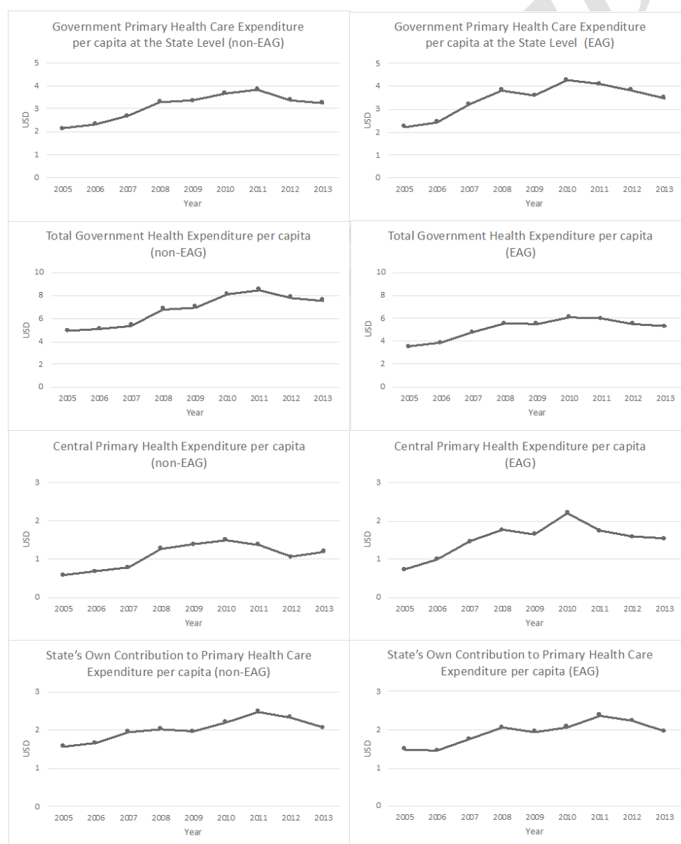
Figure 1. Average Per Capita Central and State Level Government Expenditures for EAG and non-EAG Indian States, 2005-2013, (2005 USD). Abbreviation: EAG, Empowered Action Group.

a Sample size for each variable for each year is N=16 except for year 2007 where Andhra Pradesh had missing figures for the following indicators: GPHCE at the state level, GPHCE per capita at the state level, state's own contribution to primary healthcare expenditure and state's own contribution to primary healthcare expenditure per capita; and year 2007 where Jharkand and Kartanaka had missing figures for the following indicators: state's own tax revenue and state's own tax revenue per capita missing for Jharkand in 2007 and Karnataka in 2009. Exchange rate conversions were extracted for relevant years from the World Bank conversion database. 29