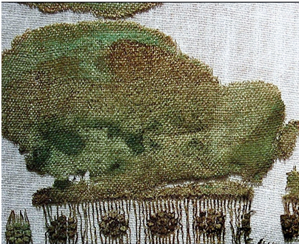
Figure 1. Remains of textile I (photograph courtesy of National Museum of Irān).*

folded in eight layers and laid inside a piece parts of which were completely carbonized (Figure 3). The preserved remains supported fringes at the right angles but no trace of embroidered rosettes (Mo'taghd 1982); Textile III had no fringes preserved (Figure 4) and it was impossible to determine its original dimensions (Mo'taghd 1982: 118).