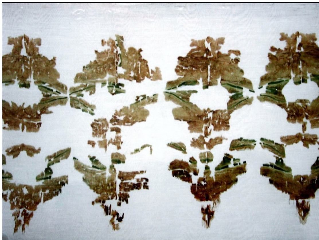
Figure 4. Remains of textile III.

of the Persian empire. According to Herodotus, after Egypt was subdued by Xerxes (486-465 B.C.E.), the Persian king amassed an army from all nations in order to take over Greece. Among these peoples were the Indians who “wore cotton ( tree wool ) dresses and carried bows of cane” (Herodotus, Histories VII: 65). The sole Biblical reference to cotton uses the word karpas , which is a cognate of the Sanskrit word for cotton kārpāsa . According to the Book of Esther 19 a sumptuous banquet lasting seven days was offered at Susa “in the court of the garden of the king’s palace” by the Persian king Ahasuerus, most probably Xerxes. Inside the court “there were white cotton curtains and blue hangings caught up with cords of fine linen and purple to silver rings and marble pillars, and also couches of gold and silver on a mosaic pavement of porphyry, marble, mother-of-pearl and precious stones. Drinks were served in golden goblets, cups of different kinds, and the royal wine was lavished according to the bounty of the king” (Esth 1: 2-7, RVS).