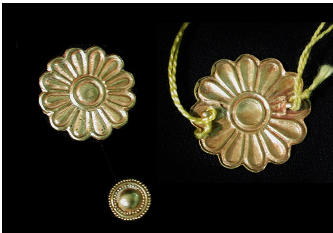
Figure 6. Reverse view of golden bracteates with twin loops for attachment to garment.

turmoil for Mesopotamia and Elam. In this context, maritime trade between Elam and Dilmun may have provided unique economic advantages for both parties. Easy access to eastern Elam via the Persian Gulf port of Bushire (ancient Liyan) may have encouraged rapprochement, further strengthening exchange relationships and political ties. After the collapse of the Assyrian empire, late Babylonian sources are silent regarding any possible Dilmunite-Elamite associations. In the absence of written records one can only guess that, as evidenced by the presence of cotton textiles in the Arjan tomb, these relationships came to be sustained during the late Neo-Elamite period and continued to further prosper with the emergence of the Achaemenid Persian Empire.