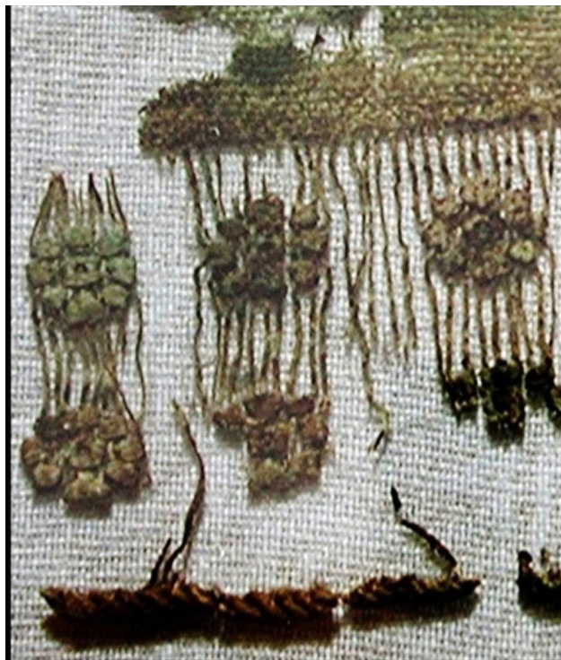
Figure 2. Detail of embroidered rosettes from Textile I.

the production of cotton to agrarian-based societies; (3) In addition to the physical hardship necessary to remove the cotton from the whole boll, the technology of cotton differs substantially from that of wool in that it requires the ability to clean the fiber by separating the cotton from any foreign matters including the seed (ginning). Furthermore, the spinning technique requires different types of spindles; “the hairs of cotton are so short and delicate as to require a special method of spinning, namely with a small, light spindle fully supported so as not to put weight on the half-formed tread and break it” (Barber 1991: 33; see also Grant 1954: 449). Thus, given the delicate nature of the fiber, tension is critical in spinning cotton, which is why spindles weighing an ounce or less are required. 12 In other words, a heavy spindle may be helpful with long staple wool (perhaps 100 to 150 grams) but is useless for spinning short fibers such as cotton, flax tow, or short wool (Barber 1991: 52). 13 In short, successful production of cotton presents a number of concrete geographic, climatic, and social challenges which determine where this plant