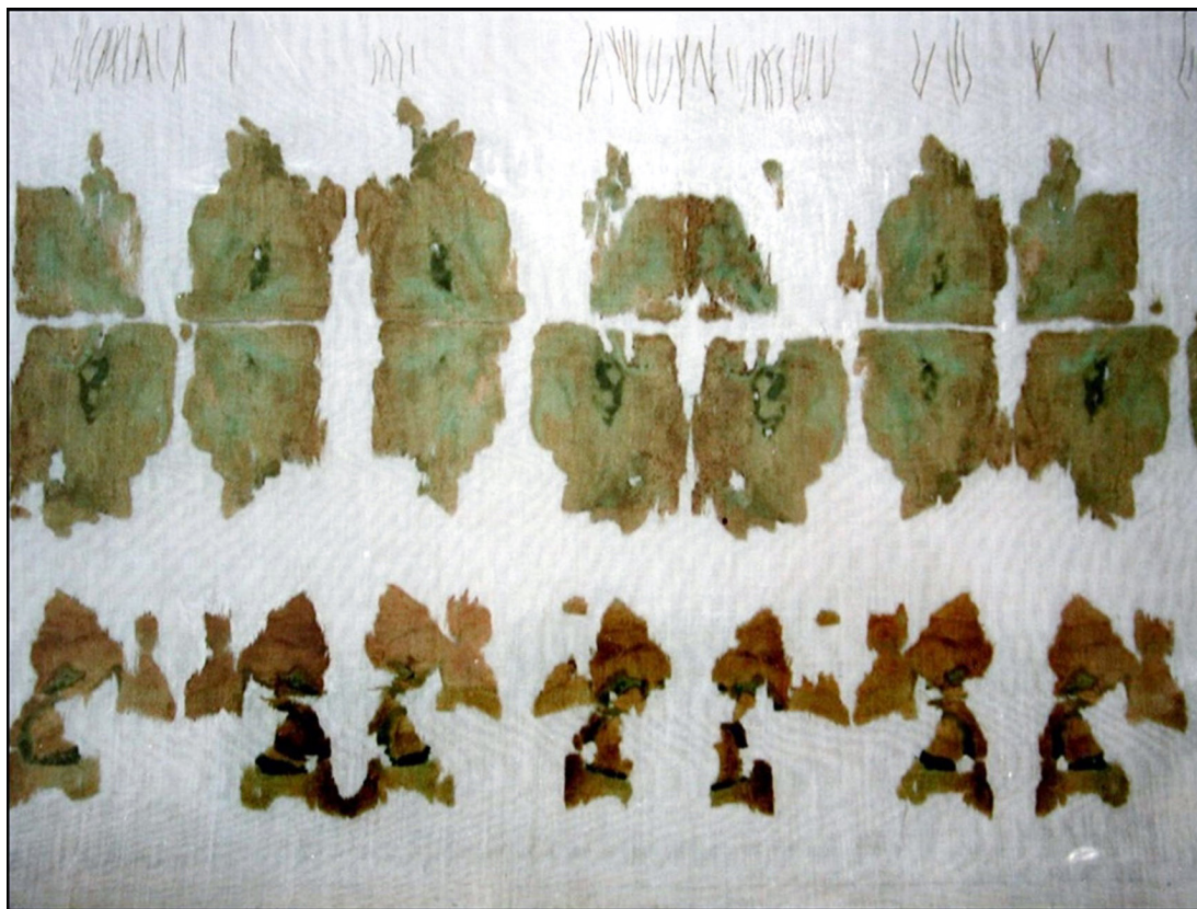
Figure 3. Remains of textile II.

site of Shahr-i Sokhta ranging from the fourth to the beginning of the second millennium B.C.E. reveals a culture specialized in wool textiles with reduced inclusion of some vegetable fibers but no attestation of cotton (Good 1999).