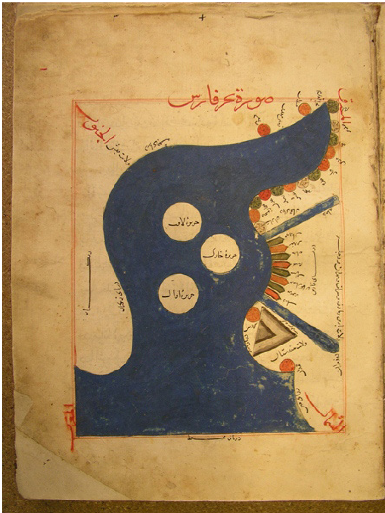
Figure. 1. Muqaddasi's map of the Bahr al-Fars