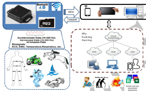
Figure 1. Data logger and its applications.

The backbone of the system was Wi-Fi communication between each data logger with the server. For this purpose ESP8266 was used and programmed as a client to communicate with a web server. To enable this data logger to apply as a wearable device, a Lithium polymer battery (3.7 v, 440 mAh) was implemented and a battery charger chip was used to supervise the battery voltage and charging. A high-efficiency step-up DC-DC converter was mounted on the board to regulate the battery voltage at 3.3 v. The ESP8266 has no flash memory, therefore a 32 Mbit flash memory implemented in this data logger and a MicroSD card socket was mounted and connected to ESP8266 SPI port for offline data storage in FAT32 format on a 2GB MicroSD card.