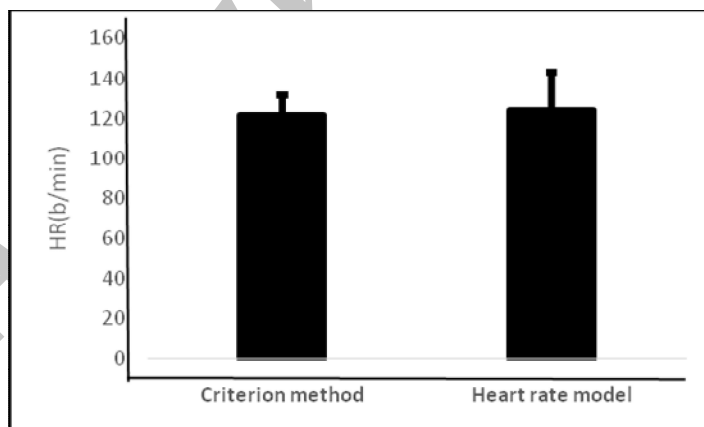
Figure 3. Mean and standard deviation of aerobic threshold (AT) estimated by the criterion and Dmax model.

The results showed that there was no significant difference between the criterion (respiratory gas analysis method) and HRPC methods ( 122.46 \pm 9.52 b/min versus 124.03 \pm 18/89 b/min; P = 0/599 ; Figure. 3).