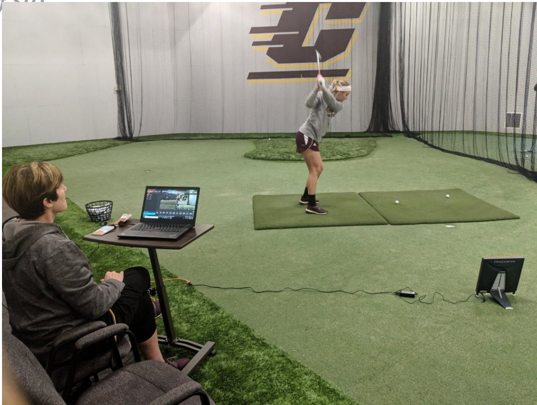
Figure 1. The experimental configuration.