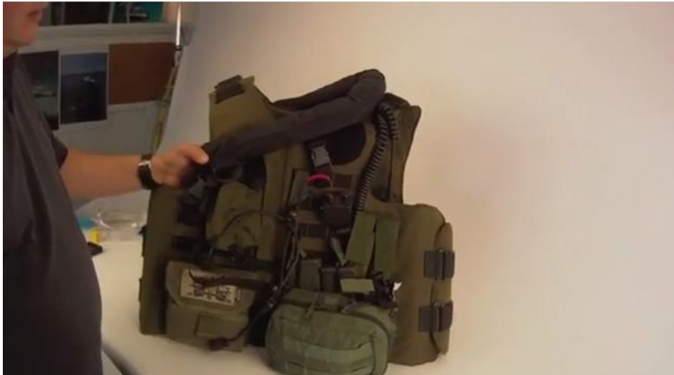
Figure 2. Garment integrated personal flotation device

resuscitation action. A garment protects cricoid cartilage from compression that mounted dual zipper cover releases a balloon that creates a reliable mandibular shelf and bracket while simultaneously encapsulating. This device is adjustable that, a dual wall personal floatation device (PFD) with its oversized inner balloon creates extended midline crossing. A dual chambered inner balloon separates the compressed gas inflated high-pressure low-volume balloon required for a corrective turning from the higher-volume and lower-pressure orally inflated chamber which provides the additional buoyancy needed to improve floating. A dual release fabric lock handle allows for the quick release of the deflated redundant abdominal PFD which then serves as a thrown rescue inflatable device. A PFD integrated variable-displacement dual-pressure personal life raft uses compressed gas to inflate a rigid floor conferring sufficient buoyancy to support the Marines 35 lb. Rucksack[12] (Figure 2).