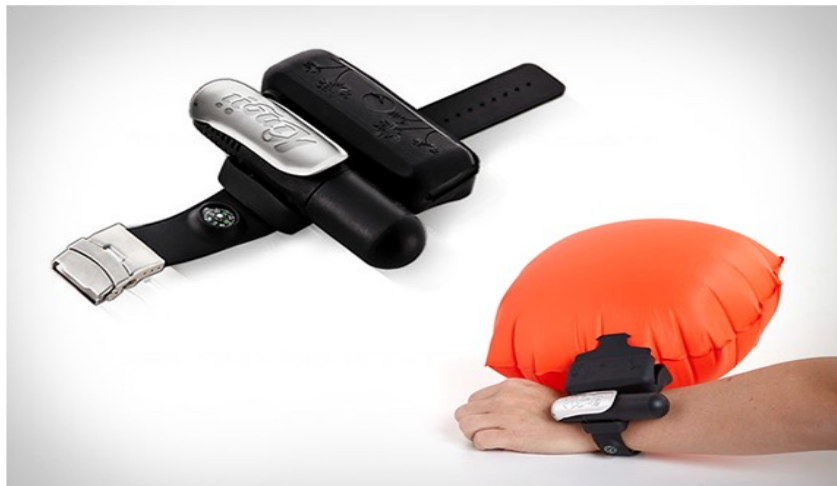
Figure 3. Kingii Wristband

Kingii is a rescue wristband than can be used in different areas like seas and pools. This device is made of the main air cylinders, air bags and valve constituting the wand. Function of this device is as follows: in dangerous situations, the user simply moves the valve, there will be a life-saving balloon expands out and immediately filled with carbon dioxide gas. Kingii needs to bring high-pressure gas cylinders, weight up to 280g (Figure 3) [16].