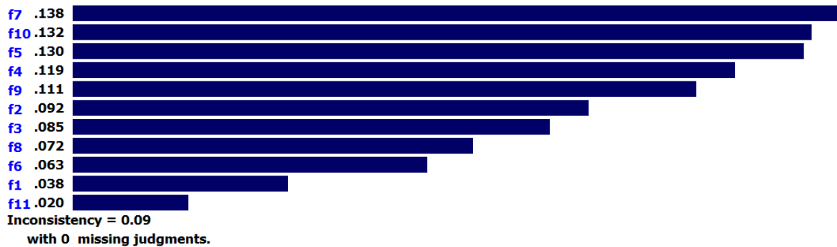
Figure 2. The final results of paired comparison of indices in relative weight state

For each matrix divided by the incompatibility index into the stochastic matrix incompatibility index is a good criterion for judging incompatibility, which we call the incompatibility rate. If this number is less than or equal to 0.1 the system compatibility is acceptable otherwise judgments should be revised.