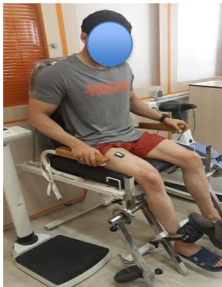
Figure 2. Maximum isometric voluntary contraction for quadriceps muscles