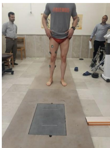
Figure 3. Activity of selected lower limb muscles during running