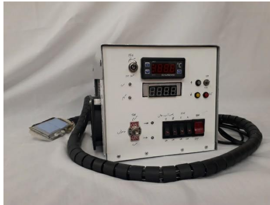
Figure 4. Fully automatic cooling device

In the present study, a fully automatic cooling device at different temperatures performed cryotherapy. This device is researcher-made. Predicted temperatures for cryotherapy were 8 ° C and 11 ° C (Figure 4).