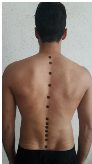
Figure 1. Main spinous processes for detecting the contour of the thoracic and lumbar spine

In the third stage, the examiner located behind the subject in order to specify the identified spinous processes using pen (Figure 1). More specifically, all of the spinous processes marked with the tip of pen and the spacial coordinates of them were automatically sent to the computer system (BLA softwar has been made by Pouyanazma co.). Anthropometric thoracic and lumbar spine was calculated using a new algorithm with patent cod 93208 (Figure 1- Figure 5). For every subject, three observations were measured by experienced technicians of BLA and further the average of 3 trials were used for further analysis (11,12).