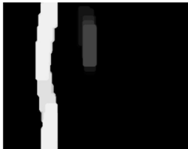
Figure 4. An example of images to which disk operation is applied