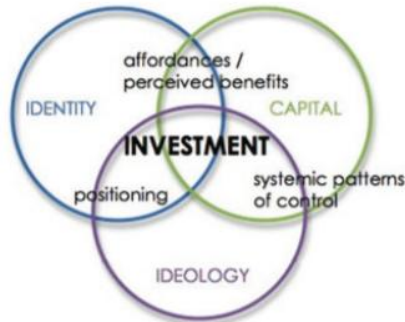
Figure 1. Model of Investment (Darvin & Norton, 2015)

Enlightened from this model, when learners move across communities, the value of their economic, cultural or social capital also shifts across time and space. It is also normal for their ideologies to collude and compete. Their identities and self-positioning are hence shaped in different ways. Learners' symbolic capital (i.e., linguistic or cultural capital)—including their prior knowledge, home literacies, and mother tongues—influence their investment in the language learning practices. The investment is dependent on learners' perception of affordances or benefits for the self, or the action possibilities perceived by the learners.