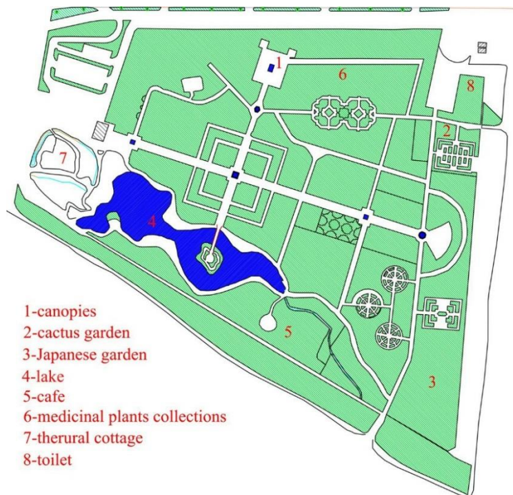
Figure 3. The Complete Map of The Flower Garden located in Isfahan, Iran, designed based on Google Map by Soleimanpour (2016, September 5)