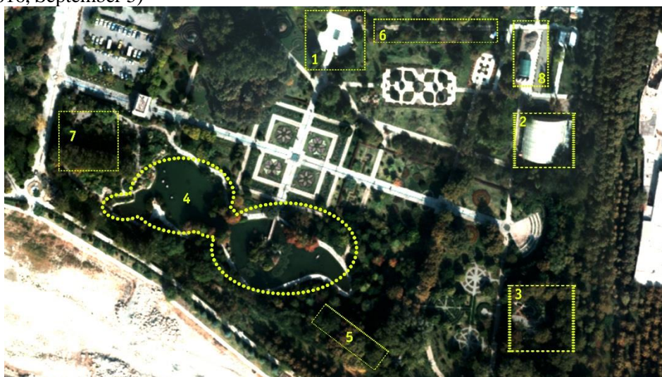
Figure 4. Aerial Photo of Flowers Garden.

(1. Canopies, 2. Cactus Garden, 3. Japanese Garden, 4. Lace, 5. Cafe, 6. Medicinal Plants Collections, 7. Rural cottage, 8. Toilet)