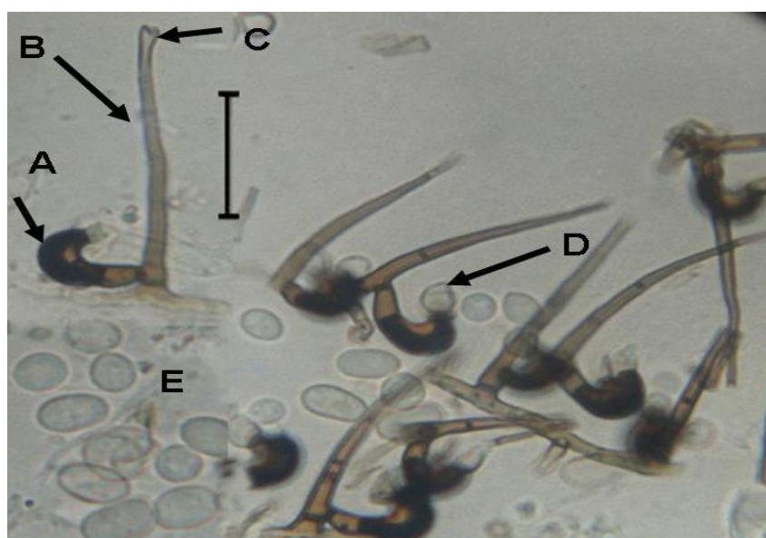
Fig.4. Zygosporium oscheoides : A. Vesicular conidiophores, B. Setiform conidiophores, C. Clavate apical cell on setiform conidiophores, D. Young conidia producing on vesicular conidiophores, E. Conidia. Scale bar = 20 \mu\text{m} .