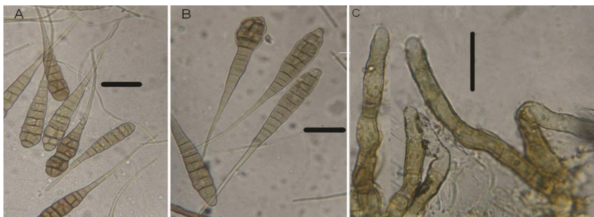
Fig. 1. Alternaria calendulae : A. - B. Conidia and C. Conidiophores, scale bar = 50 \mu\text{m} . Specimen examined: on Calendula officinalis L., Guilan, Rasht, Feb. 22, 2011, V. Taheriyani (933).

Specimen examined: on Ligustrum vulgare , Guilan, Rasht, Nov. 11, 2011. V. Taheriyani (939).