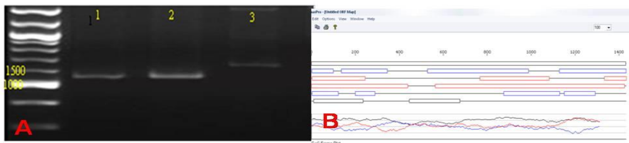
Fig. 2. (A) Related fragments of endoglucanase gene (Line 3) and cDNA of expressed egl gene (Lines 1-2) amplified by using specific primers for Trichoderma viride 156MS. (B) ORF of coding sequence region (cDNA) related to Endoglucanase gene in T. viride 156MS.

Nucleotide sequence related to coding region of egl in Penicillium oxalicum cited in NCBI database, has the size of 1437 bp. Comparison of amplified sequences with those of 5-P flanking regions of cellulase genes in other fungi revealed the large areas of homology about 98%. The sequence related to coding region of \beta -1,4 endoglucanase (CDs) showed a high degree of nucleotide sequence similarity to genes assigned in the genomes of Penicillium isolates. Protein sequence also showed a strong sequence similarity to endoglucanase genes in Penicillium isolates. The sequence determination of this isolate has been deposited in GenBank under accession number of JF309107. Bioinformatics analysis of queried sequence showed an open reading frame (Fig 3B).