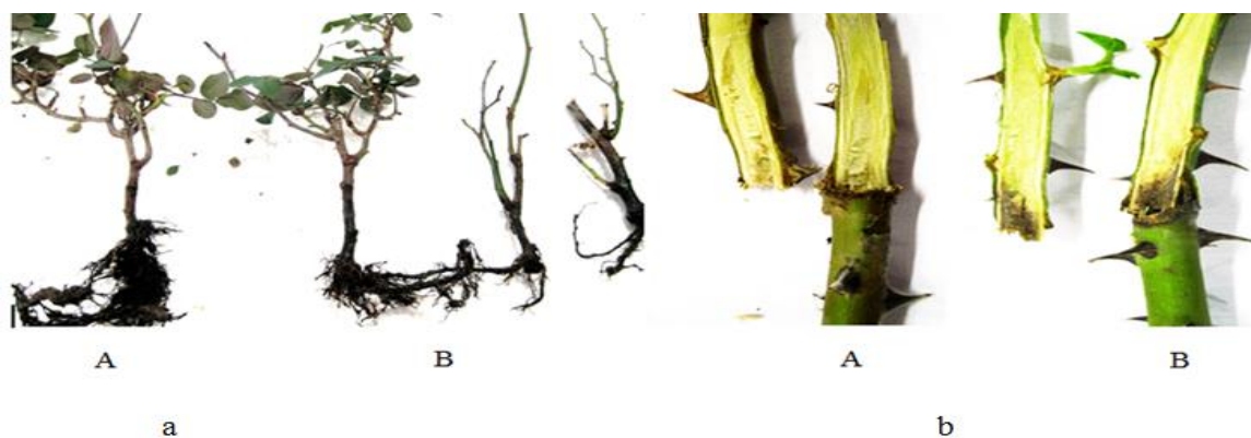
Fig. 2. Pathogenicity tests of Rhizoctonia sp. AG-G. on rose seedlings, (a) in vivo test, (b) in vitro test, A: control B: inoculated by Rhizoctonia sp. AG-G.

PCR amplification of the rDNA ITS region of Rhizoctonia isolates using the ITS1F-ITS4 primer pair gave the PCR products of 695 bp. (Fig. 3), containing 72 bp of the 3' end of 18S rDNA, 177 bp of ITS1, 162 bp of 5.8S rDNA, 254 bp of ITS2 and 30 bp of the 5' end of 28S rDNA (Fig. 4). The complete genomic DNA sequence of the amplified region between the primers ITS1F and ITS4 was obtained for the binucleate Rhizoctonia isolate VRU-R3. The rDNA ITS nucleotide sequences of the isolates showed high sequence homology (100% identity) and no significant intraspecific variation was observed. The sequence is available in GeneBank with Accession No. KC825348.1.