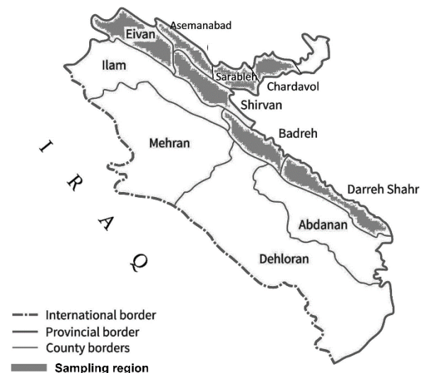
Fig 1. Geographical origins of the six FOC populations from Ilam province, were used in this study.