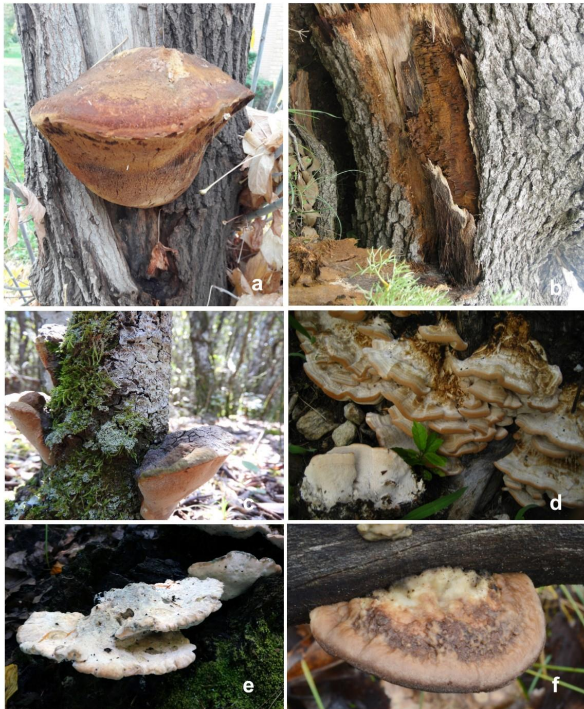
Fig. 2. In situ basidiocarp photos of some polypore species discussed in the text. a. Inocutis levis (coll. Ghobad-Nejhad, in 2016); b. Inonotus krawtzevii (coll. Ghobad-Nejhad, in 2015); c. Fomitiporia rosmarini (Bernicchia 1464); d. Fomitopsis iberica (Cartabia 3142); e. Fomitopsis spraguei (Bigelow, June 2017); f. Trametes ljubarskyi (Botyakov 3627).

distributed in Irano-Turanian region e.g., Amygdalus , Pistacia , and Prunus , have possibly been originated from the latter region. Besides, to better explain the flora relationships, it is possible to speculate some sort of 'species turnover' or replacement of species in plant communities, in a way that some Mediterranean